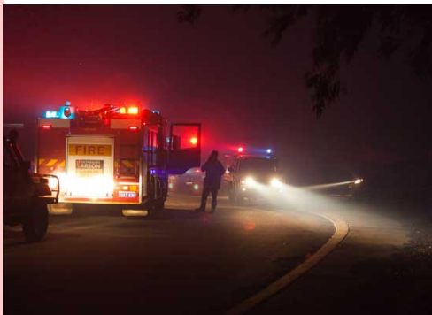
Above: The recent fires in the Perth hills left a young mum-to-be with nothing for the impending birth of her baby.