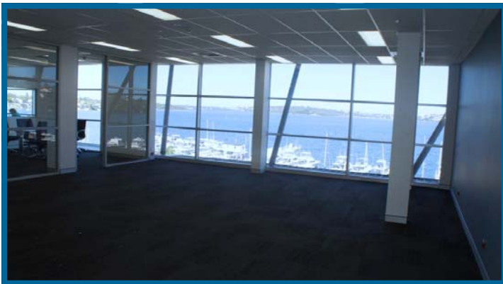
Above: Work coming to an end at Bethesda Hospital for new orthopaedic consulting suites.

There has been action-a-plenty at the hospital of late, with the refurbishment of the 7th operating theatre and the development of the consulting suite area next to the café. The commissioning of a 7th theatre is seen as a very positive step towards meeting the increasing demand for operating time from new and existing surgeons.